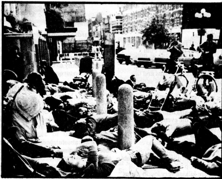
CND "Die-In" outside Islington Town Hall

ONE SUNDAY earlier this month two men met in a cottage in the picturesque village of Great Missenden, Buckinghamshire. The sun was shining, the birds were singing so off they trolled to some nearby woods. After a long non-political encounter they returned to the cottage car park to find the local Bobby noting down the numbers of their cars. With brick-red face and reassuring smile, the constable murmured that he always took down the car numbers because the area was "rough". Thereupon, one of our heroes offered the Bobby his name and address in order, so he explained, to save the Force the time and expense of phoning the vehicle registration computer at Swansea. At this the cheerful Constable turned nasty and threatened to run them in . . . what a very long list of cars that park in "rough" areas they must have.