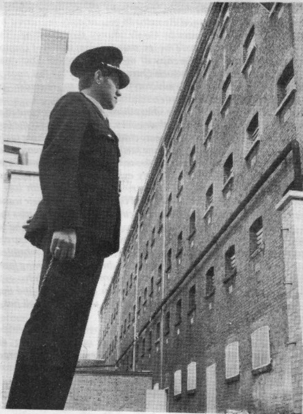
Because guards don't make a move when a deadly battle rages, you think they're brutes and you're right." (Genet)

Of course this is a very useful piece of legislation. It's one of those "magic buttons" Mrs. Thatcher is so earnestly looking for: declare the four countries that make up these islands an approved prison and you neatly solve the problem. This is not likely to happen tomorrow, but it is a mistake to see this Act solely as a response to the action of the prison officers. This is emergency legislation, not for a particular dispute, but for a system which is creaking towards collapse. As the social crisis becomes yet more severe, the state, if it intends to maintain its power and we have every reason to believe that it does, is going to need every resource available. The authority to turn the school down the road in-