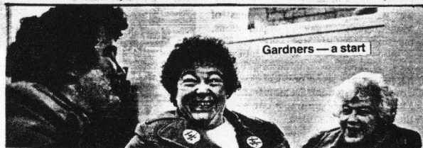
Gardners — a start

None of this would matter of course; except that Steely Dan are under no illusions. They've chosen the easy way. It's a glamour profession. The L.A. concession. Concession? Call it a fucking cop out. The sooner we forget about these miserable artists the better. You can't even dance to them anymore.