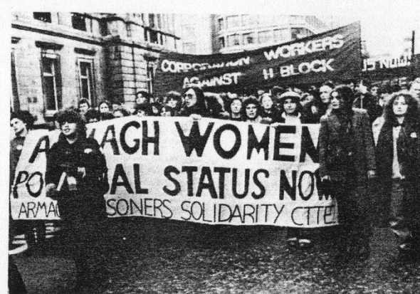
Saturday 22nd November: in Dublin, twenty thousand march in support of the Armagh and H-Block hunger strikers.

Answer: when he's in the Special Air Service, the Royal Ulster Constabulary, the Ulster Defence Regiment or the British Army. The members of these forces kill, torture, maim and brutalise every day of the week in the North of Ireland. They murder, with or without uniforms according to rules laid down in the Queen's Regulations. They kill and maim in the pursuit of their wage-packets and the political objectives of the British State. They torture in order to maintain the hold of the British State on the economy, life and culture of the Irish people. They take people's lives for political reasons: they are political killers.